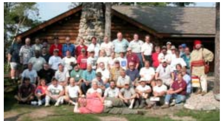
Rendezvous alumni gather for a photo

The afternoon was a time for shopping and visiting old haunts in Ely or taking tours of the Dorothy Molter Museum or International