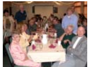
It's a banquet!

Attendance at the banquet of 140 made this Rendezvous nearly a record. Also notable was the