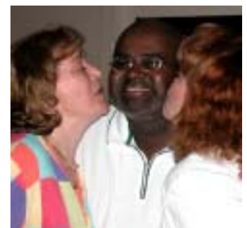
Kiss, kiss (He'll be back!)