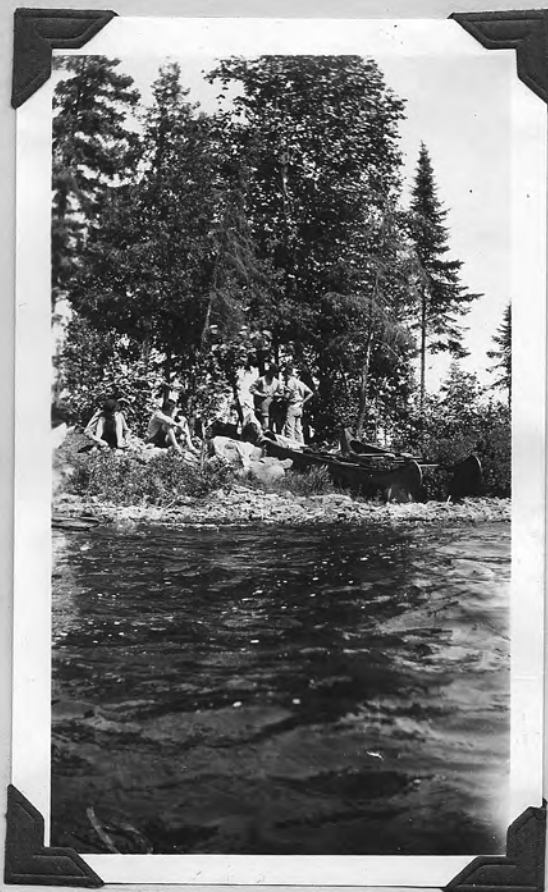
Dinner across from ranger tower on Lake Kewekabic.