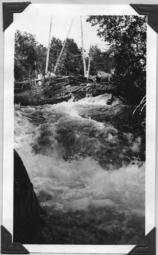
Remains of Old-time logging operations.