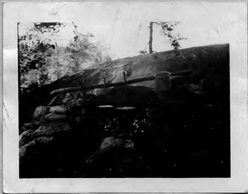
CAMPSITE - LOWER BASSWOOD FALLS. SUPPER'S ON THE FIRE AND COMING ALONG FINE.