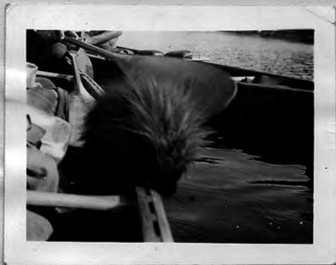
PORCUPINE FOUND ON WIND LAKE RIVER ON LOGS NEAR SHORE. STEWED UP, TASTE LIKE DUCK.