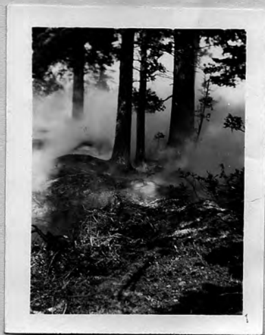
FOREST FIRE I REPORTED TO CANADIAN RANGER. FIRE FOUND ON AGNES LAKE ON EAST SHORE FROM SILENCE CUT OFF.