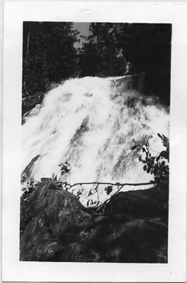
Falls on Lake Agnes