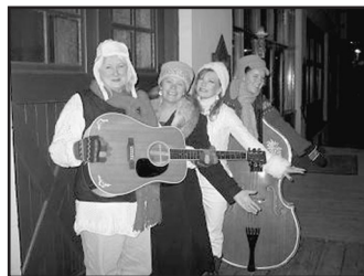
Warm Women of the North from Duluth