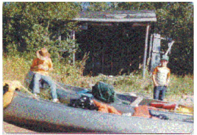
Scouts on a Lake of the Woods canoe trip relax near the remains of the Camp Chandawaga boat house. Camp Chandawaga was 10-12 miles from Ft. Saint Charles.

It was not until 1960 that the Council tried to develop a program on the property. The Council hoped that Camp Chandawaga would help create interest in the new Exploring program. Scouts came from as far away as Sioux Falls, South Dakota and Green