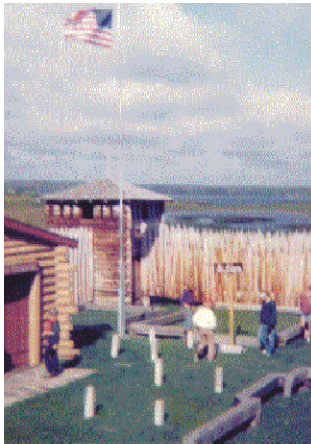
A view of the inside of Ft. Saint Charles, maintained for visitors. The fort is maintained by the Knights of Columbus, they also built cabins for priests to use on vacation. People are not allowed to camp at the fort or surrounding park, apparently to let the priests have peace and quiet.