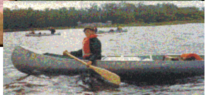
You can barely make out Ft. Saint Charles behind the head of the scout holding the paddle. The view above him is from about the same perspective, but closer. An even closer view is at left.

properly buried. Nearly 200 years later, those skeletons were used to confirm the location of the fort which has subsequently been restored and maintained by the Knights of Columbus as a tribute to Father Aulneau, first Christian martyr in western Canada. Eventually the route that La Verendrye