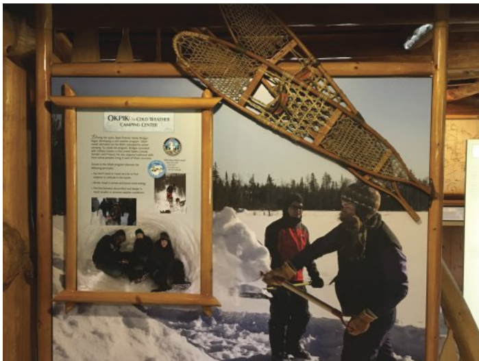
Interpretive center Okpik display.

Thank you, restless wind, for your thundering hiss through the trees, the panicky flap of the tarp, salvos of rain against our tent-fly all night— now blow these rain-burdened clouds away down the lake, unsheathe the freshly sharpened blades of the stars and lie down at last to rest before the sun comes and we crawl out of our sleeping bags, eat breakfast and paddle out into the morning