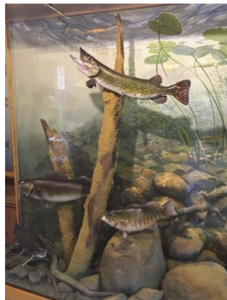
Interpretive center dry aquarium.