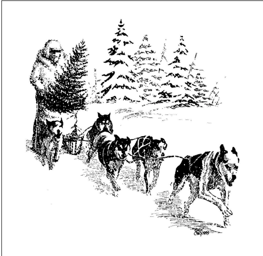
This year's SAA Holiday Card features the Bob Cary pen-and-ink drawing shown above. You can get yours with a holiday greeting inside or blank inside. Use the form below to order yours.