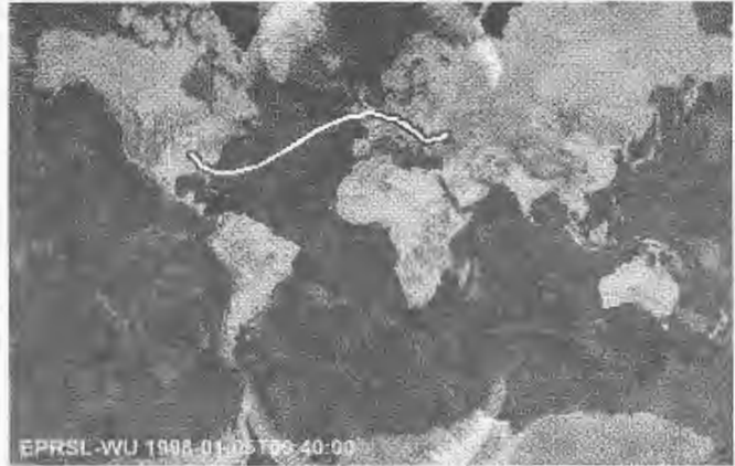
The Flight Path to Solo Spirit's landing.

but it's proved to be much more difficult than any of the competitors have anticipated." Fossett is the only one of the five competitors to attempt to circumnavigate the globe in an unpressurized capsule. "I'm going to have to reflect on whether or not this unpressurized capsule is a viable approach to flying around the world," Fossett said.