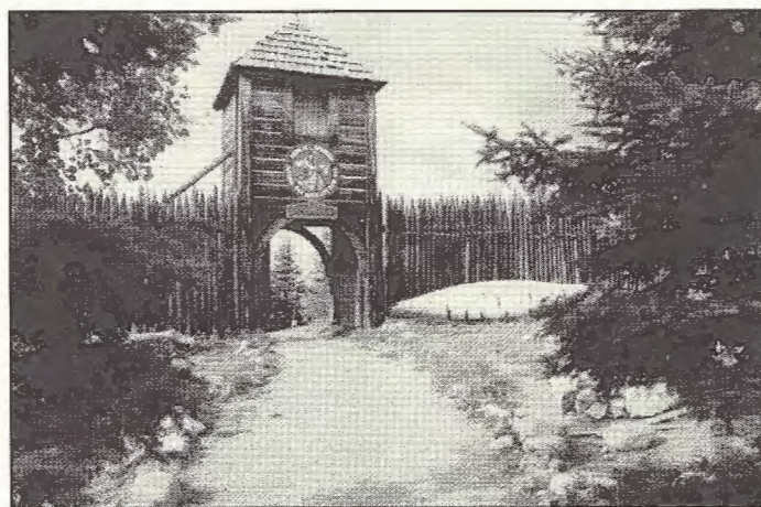
National High Adventure Base BSA entrance.

c/o Mike Bingley 233C-3250 Rock City Rd Nanaimo, BC V9T 4RS Phone: 250-668-0983